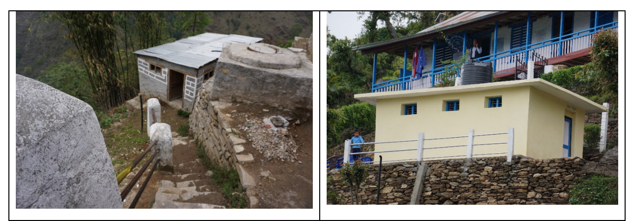
Examples of new toilet facilities built by HTUK